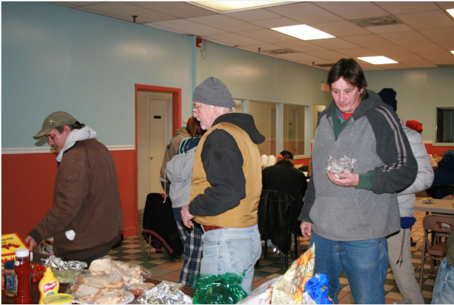
Out of the cold and enjoying a hot meal

ABCCM was asked to temporarily reopen the shelter facility on Coxe Avenue. This shelter had been closed since our homeless Veterans moved to the Veterans Restoration Quarters near the VA Hospital. We were asked to open this facility for only one weekend as a contingency plan to support the Rescue Mission, Salvation Army, A-Hope and ABCCM's other emergency shelters.